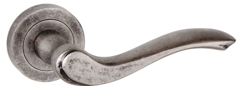
Product Finish Pictured: Distressed Silver